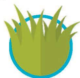
ENVIRONMENTAL INDOOR AND OUTDOOR ALLERGENS (such as pollen, dust mites, or mold)