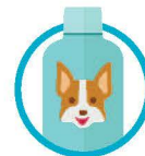
CONTACT ALLERGY carpet, deodorant, shampoo, insecticidal products